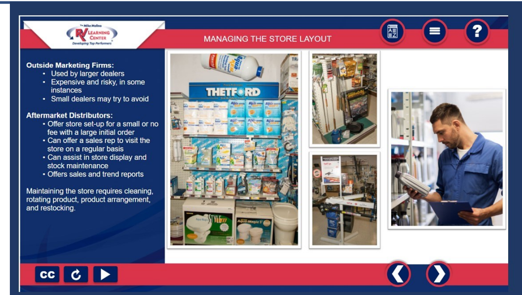
Mike Molino RV Learning Center, Parts Specialist course

Need convenient and economical training for your fixed operations team? Developed in partnership with The Ohio State University's Center for Education and Training for Employment, the Learning Center's new online training courses will help RV service management, parts, and warranty employees increase efficiency ... and reduce repair event cycle time (RECT). Fully interactive and easy to navigate, the programs offer audio voice-over and numerous progress checks. Courses conclude with a timed, comprehensive final assessment. A Certificate of Completion is available for download. Each course is priced at $150 per student, the courses do not provide certification. Email info@rvda.org for assistance.