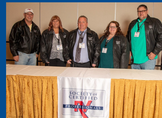
2021 Society of Certified RV Professionals scholarship recipients.

"The Society serves as a resource not only for professionals who hold or aspire to certification but for dealers and others who financially support certified professionals directly or indirectly.